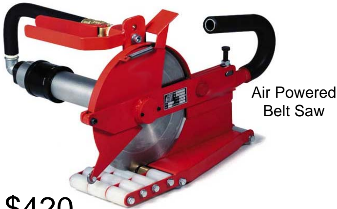
Air Powered Belt Saw