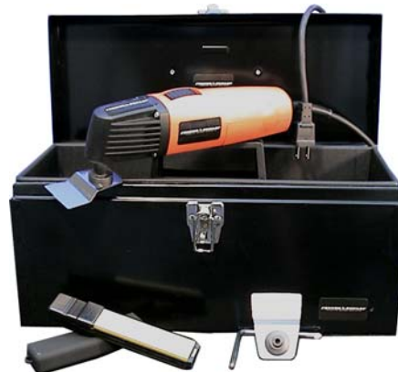
Diamond Sharpener Blades for belt cover removal